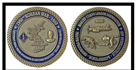
#6 — Korean War

Coin 6 in our series debuted at the 2021 National Convention in Springfield, IL. This coin commemorates the Korean War and is pictured above (actual size 2 inches) The sale of challenge coins is one of the fundraising efforts of the Marine Corps League Foundation.