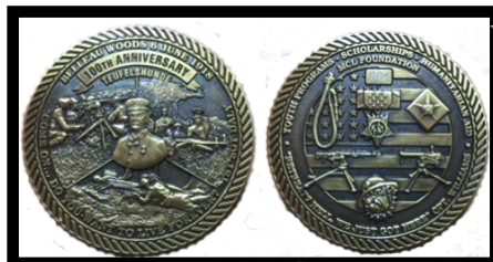
#5 — Battle of Belleau Wood