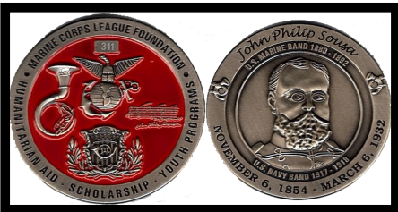
#4 — John Philip Sousa