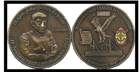
#3 — MajGen John A. Lejeune