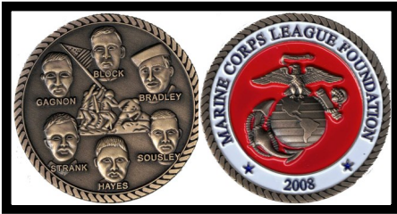
#1 — Iwo Jima Flag Raisers