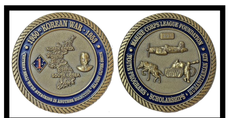
#6 — Korean War

Coin 6 in our series debuted at the 2021 National Convention in Springfield, IL. This coin commemorates the Korean War and is pictured above (actual size 2 inches) The sale of challenge coins is one of the fundraising efforts of the Marine Corps League Foundation.