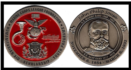
#4 — John Philip Sousa