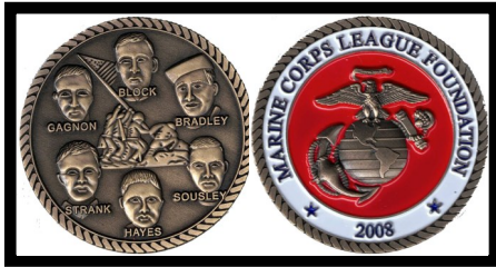
#1 — Iwo Jima Flag Raisers