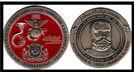
#4 — John Philip Sousa